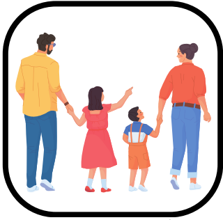
Walk with family