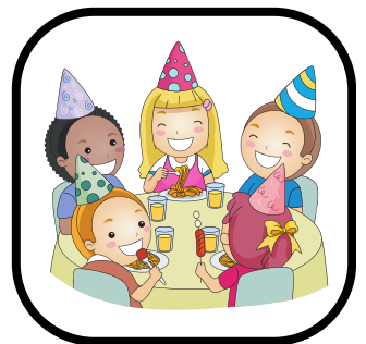
Go to party