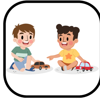
Play with siblings