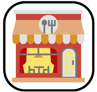
Go to Restaurant