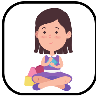
Play by self