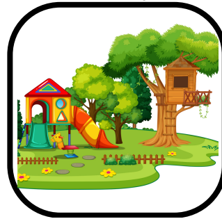
Go to park