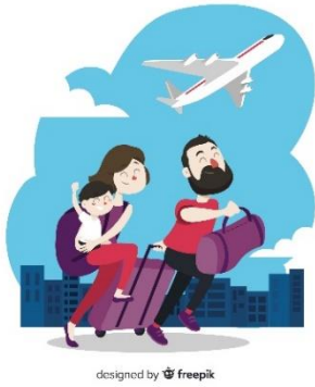
16 [ ] a trip