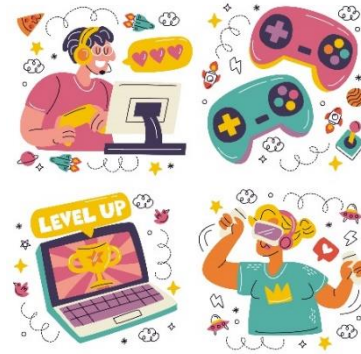
17 [ ] video games