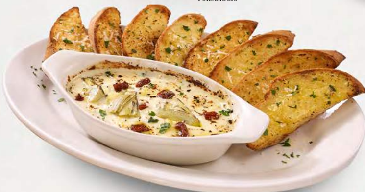
SPINACH AND ARTICHOKE FORMAGGIO