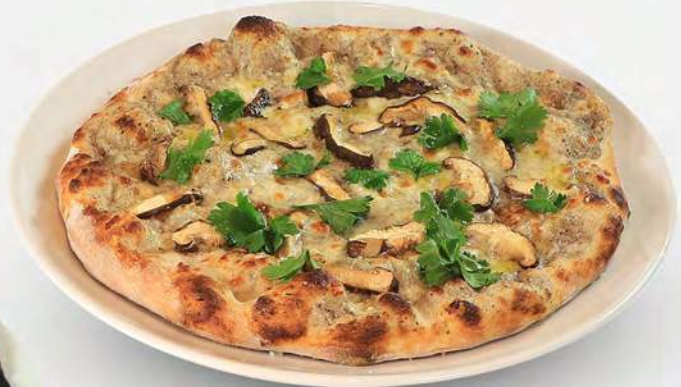
TRUFFLE & MUSHROOM PIZZA