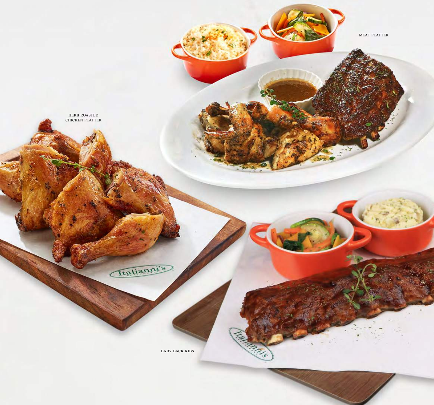
HERB ROASTED CHICKEN PLATTER

Herb Roasted Chicken, Barbecue Baby Back Ribs with garlic rice and mixed vegetables