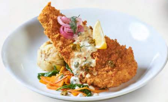
PARMESAN CRUSTED FISH FILLET