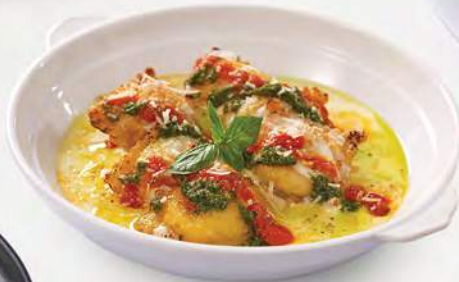
TOASTED RAVIOLI CHEESE