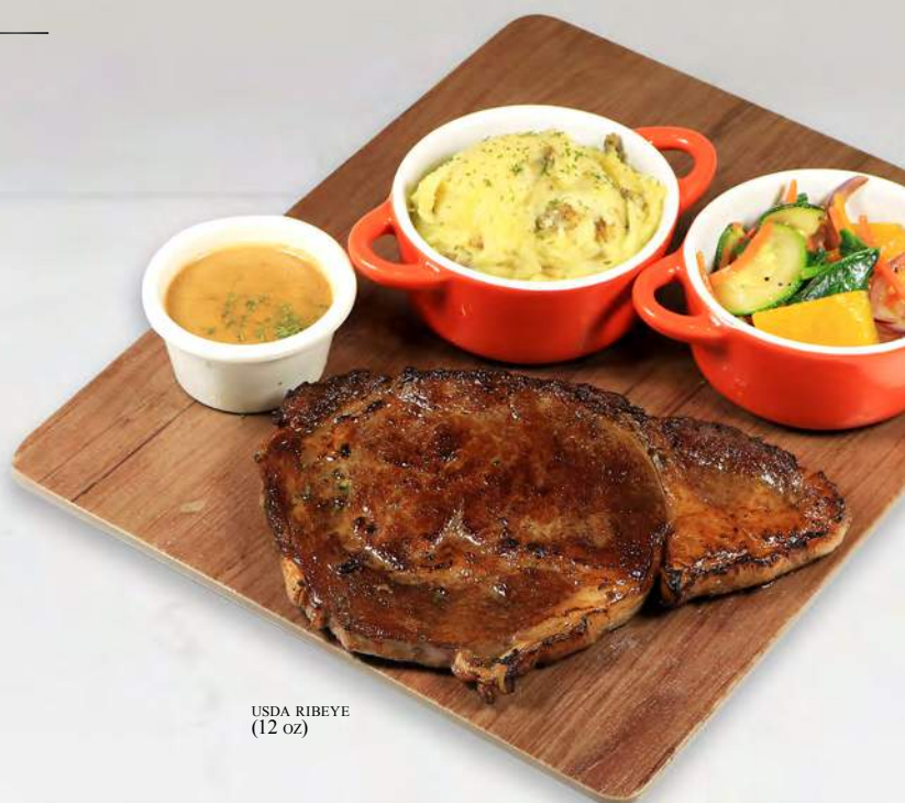
USDA RIBEYE (12 oz)

Side Dishes: Steamed rice | Garlic rice Caesar Salad | Rosemary potato Mashed potato | Mixed Vegetables