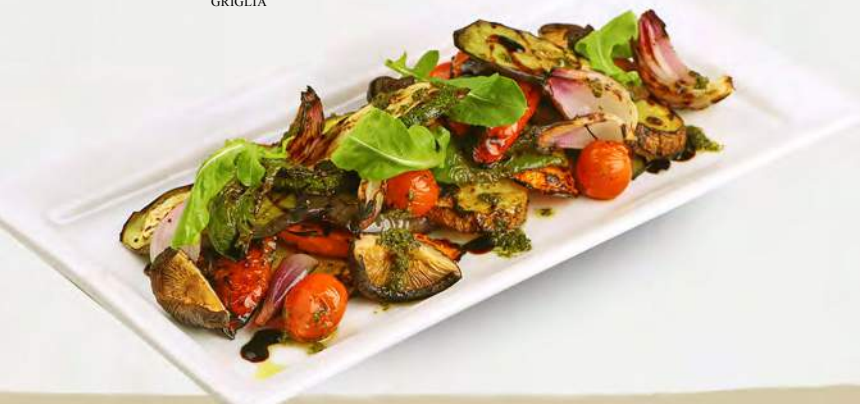
VERDURE ALLA GRIGLIA