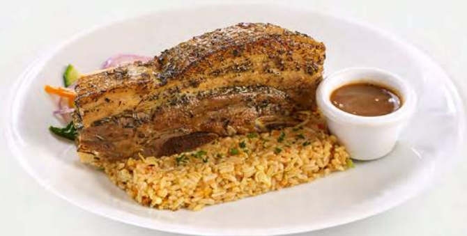
CRISPY PORK RIBS